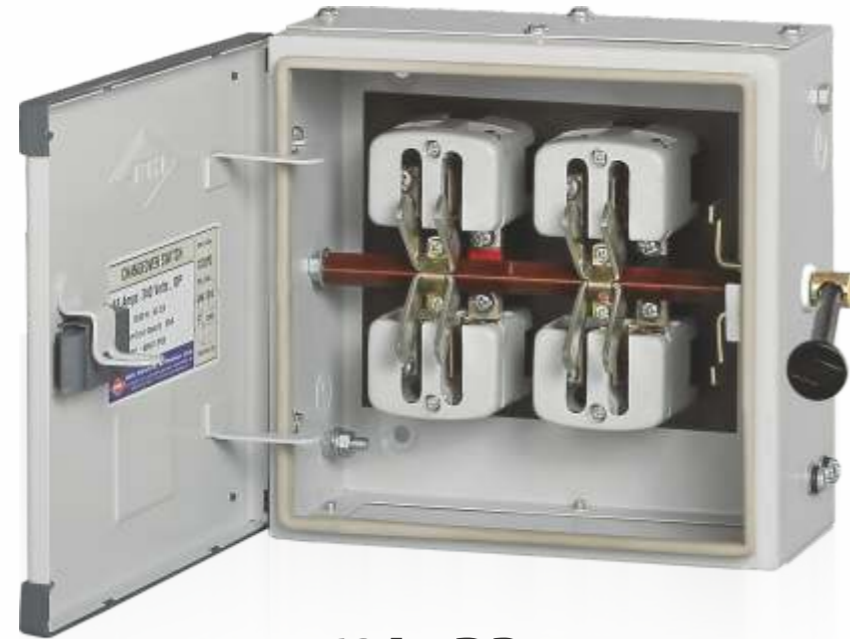
63A - DP