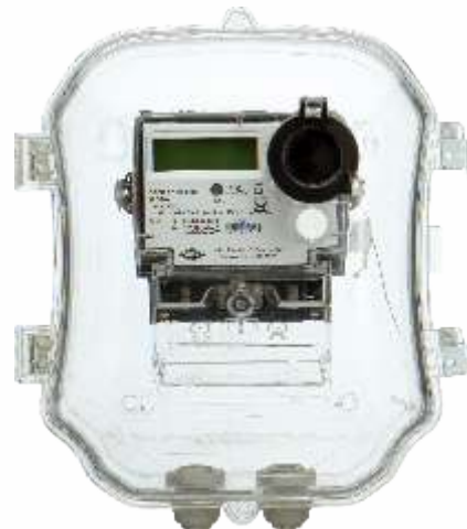
Meter Cupboard with Hinge type locking arrangement moulded in Transparent Engineering Plastic