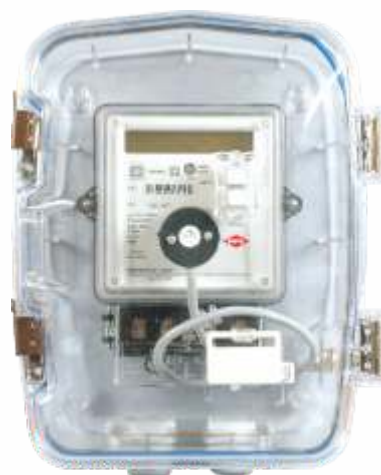
Meter Cupboard with Hinge type locking arrangement moulded in Transparent Engineering Plastic