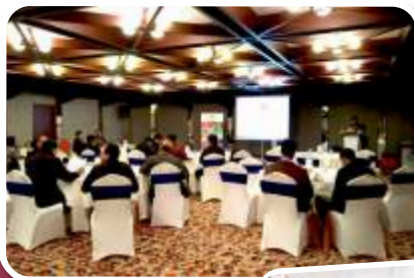
HPL Technical Seminar organised for Consultant & Contractor

The stall was visited by dignitaries including the Power Minister of Nepal and received a good footfall. The participation was followed by local consultants and contractors meet.