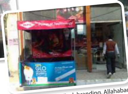
Kiosk branding, Allahabad