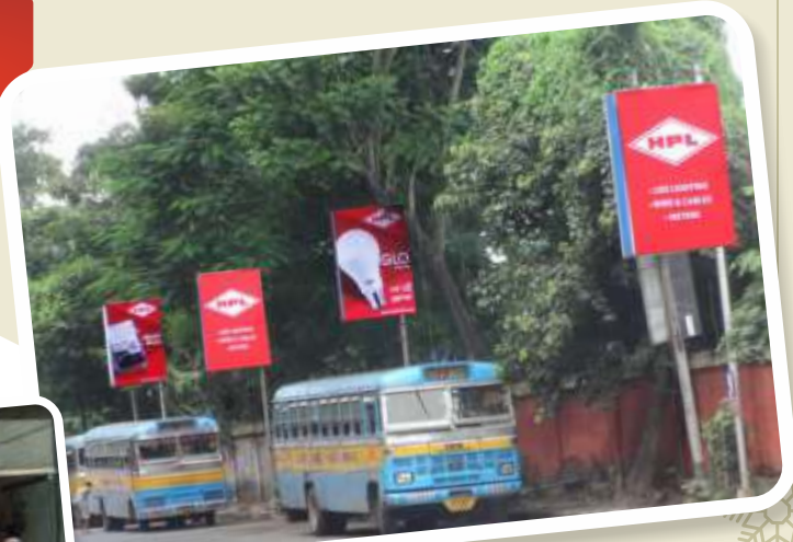
Pole kiosk branding near Ezra Street, Kolkata

Retail branding & outdoor campaigns are placed in high potential areas with a focus of highlighting household products to cater the mass audience. 6000+ dealer boards & inshop branding have already been executed in a strategic locations to cater the maximum eyeballs.