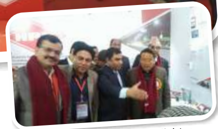
Hon'ble Barsaman Pun, Power Minister, Nepal visited our stall graced the event