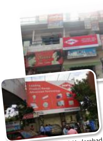
R.P. Road, Hyderabad